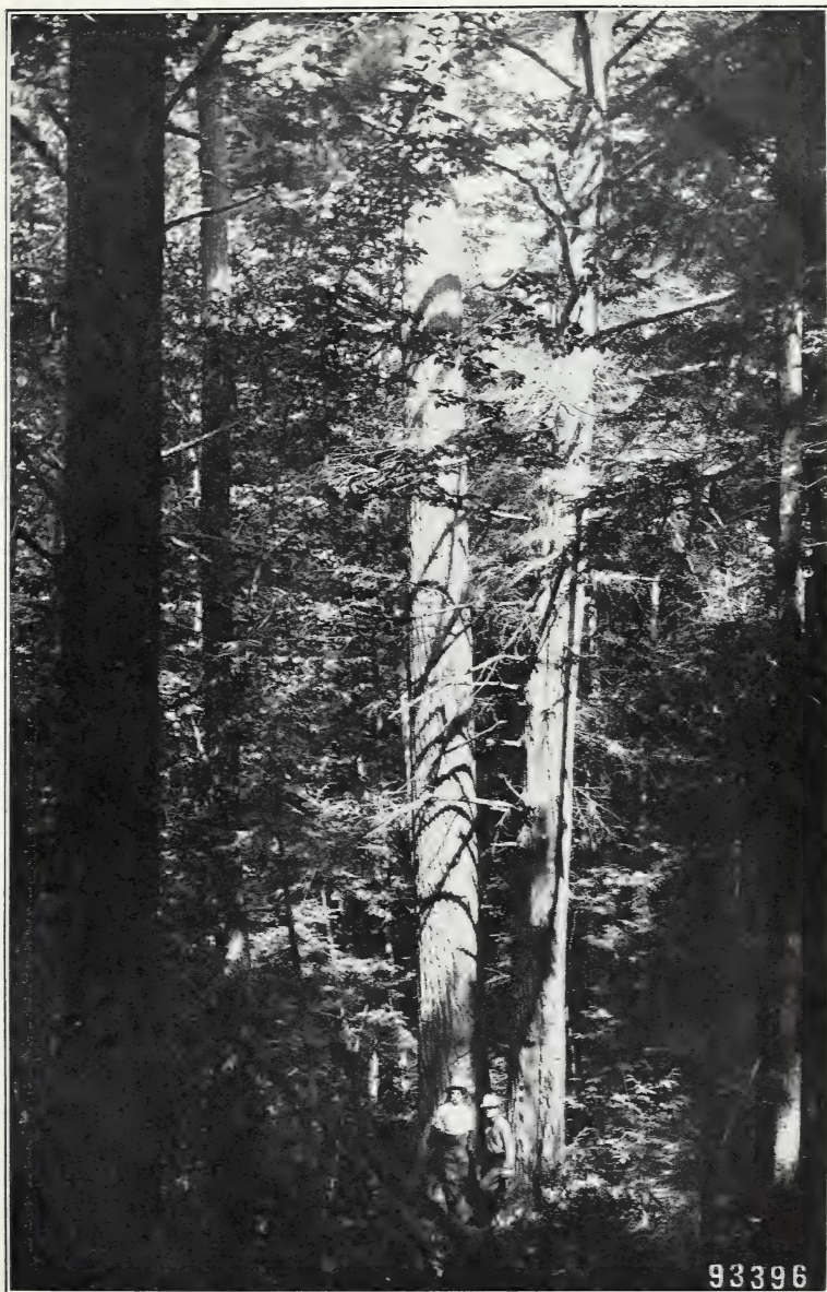
A WHITE PINE TREE, PROBABLY 250 YEARS OLD, IN A VIRGIN FOREST OF THE HARDWOOD AND HEMLOCK TYPE.

[Note the clear, cylindrical trunk, as compared with the branchy, tapering stem of the adjacent dead hemlock.]